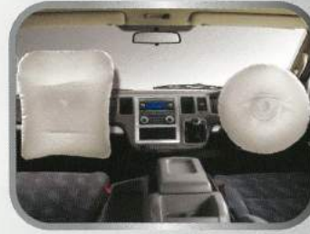
Front dual air bag