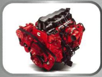
Cummins 2.8L Diesel Engine