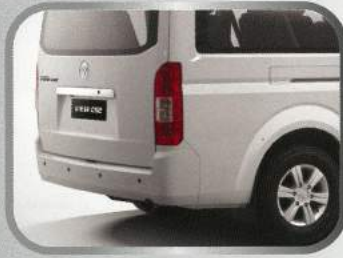
Reverse camera and reverse sensors